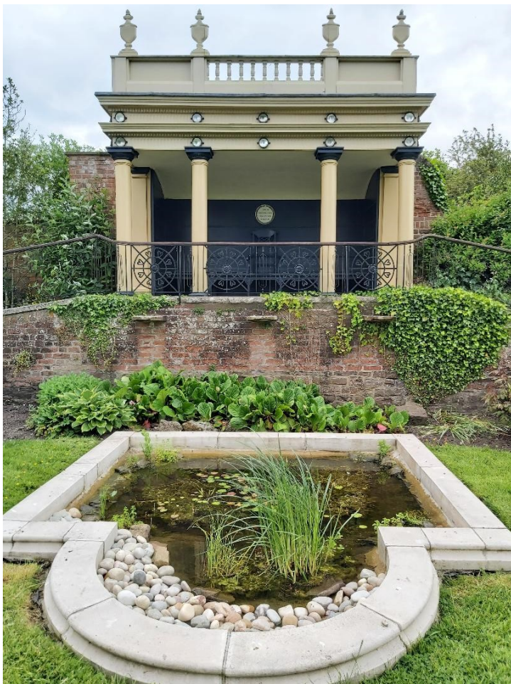
Above: The pond planted and the shallows filled with pebbles.